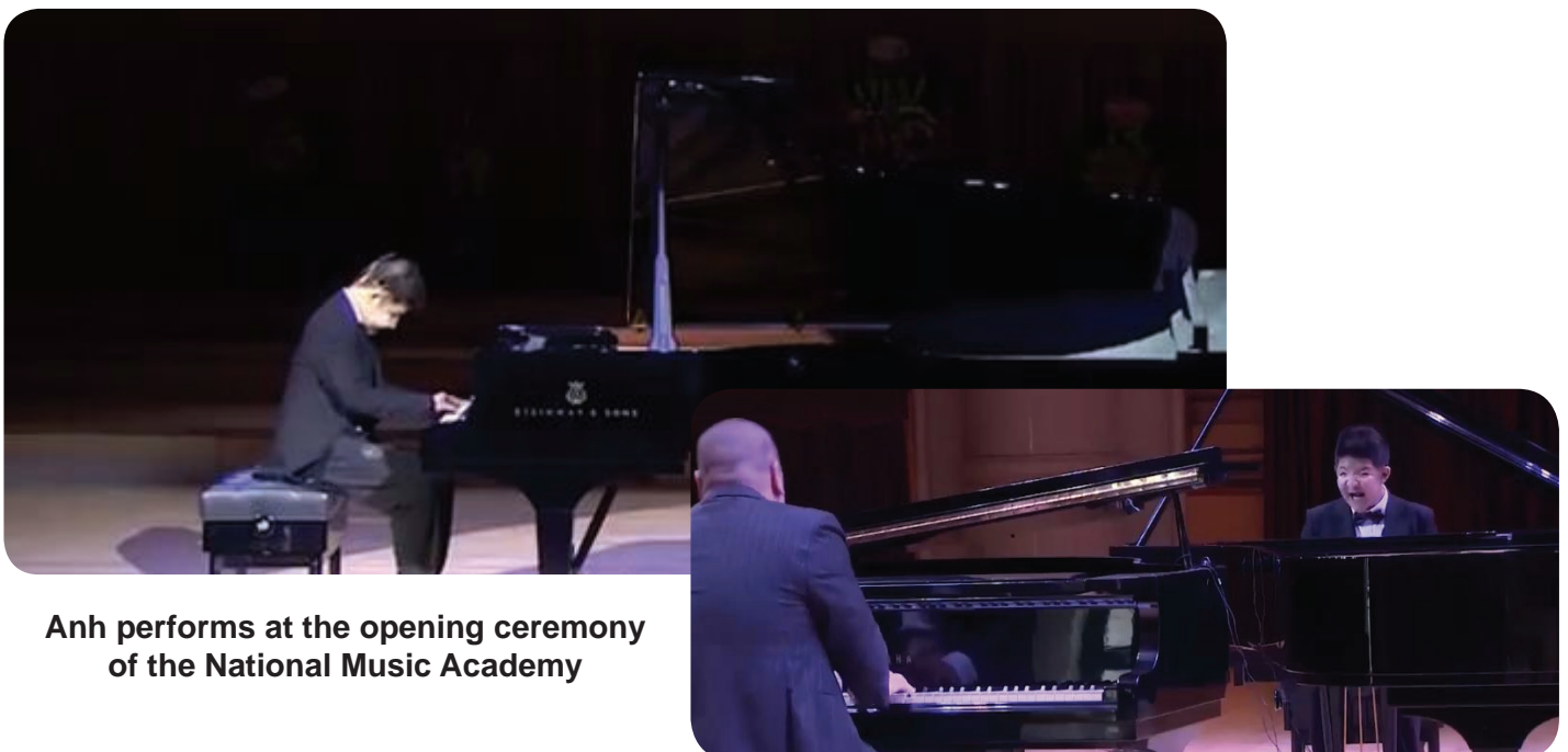
Anh performs at the opening ceremony of the National Music Academy

http://www.dailymotion.com/video/x622xgq