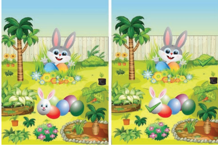
SPOT THE DIFFERENCE